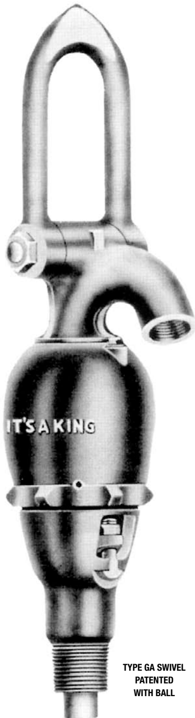
TYPE GA SWIVEL PATENTED WITH BALL